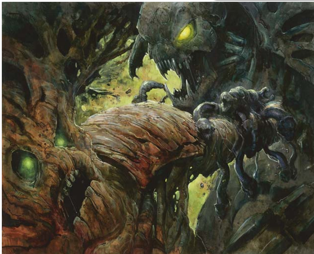
Death Mutation art by Carl Critchlow

In the background of Fervent Charge , a magnigoth treefolk joins an army of saprolings and kavu in converging on Crovax.